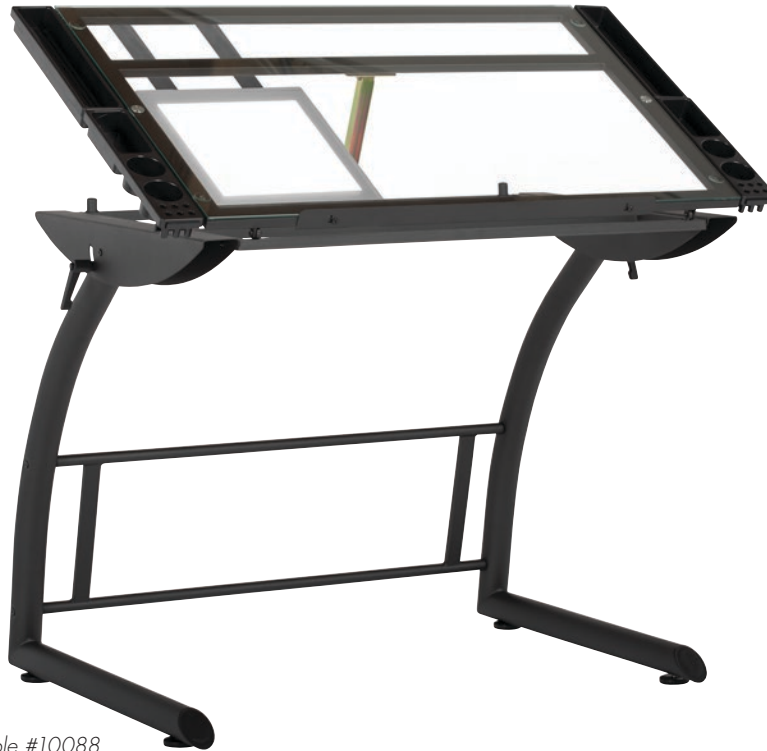
Shown with Triflex Drawing Table #10088